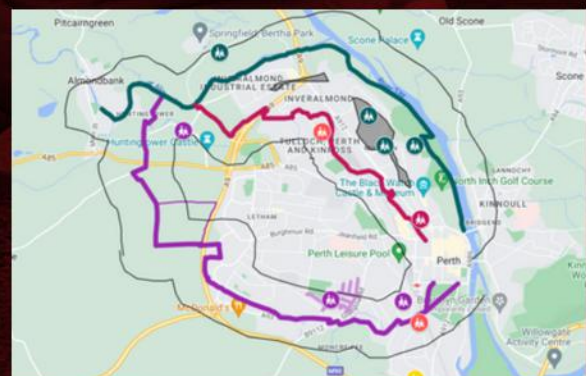
Perth Kids Bike Life Mapping

Our activities in this programme include; Bike health checks and maintenance of fleet bikes, beginner cycle training sessions, after school clubs, bike buses, bike curious events and competitions and free refurbished adult bikes.