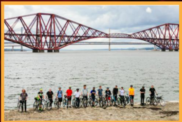
Photo of some of The Bike Station staff team out on a ride

The Bike Station's successes are made possible by our dedicated team of staff and volunteers who each contribute their unique skills, knowledge and personality.